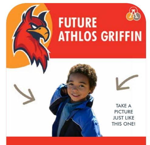
KINDERGARTEN PREVIEW Visit classrooms and learn about educational programs

This event is for both current and new families. Come meet the Athlos Team and discover the Athlos Edge!